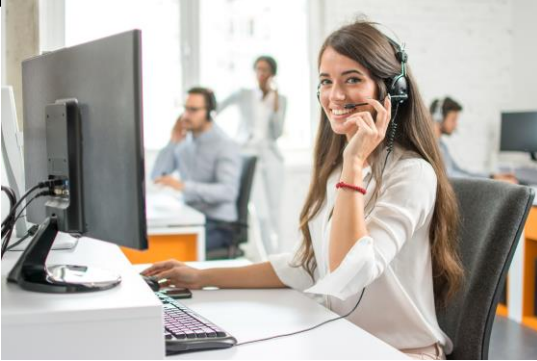
PLACE AN ORDER