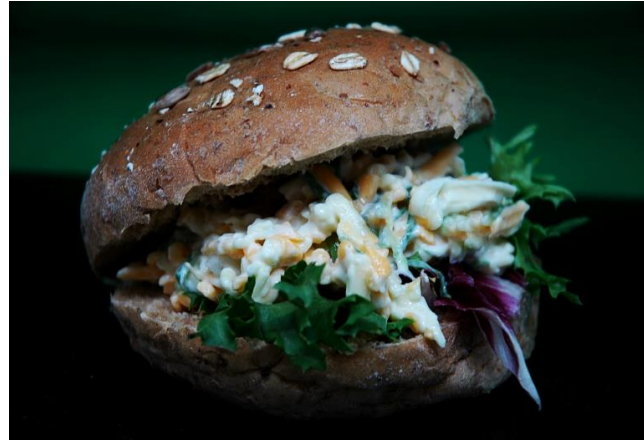
CHEESE & VEGETARIAN FILLINGS