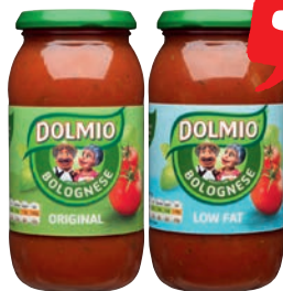
Dolmio Bolognese Original/ Low fat - 500g