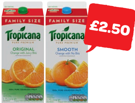
Tropicana Premium/Smooth Orange Juice - 1.75 ltr