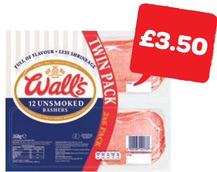
Walls unsmoked Bacon - 368g