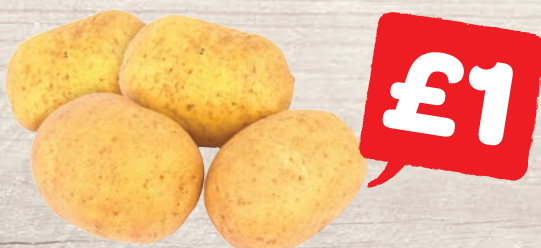
SPAR Baking Potatoes 4 Pack