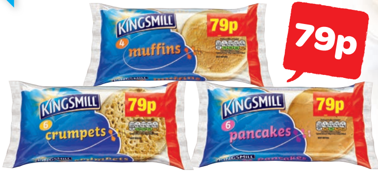
Kingsmill Crumpets/Pancakes/Muffins 4 Pack/6 Pack