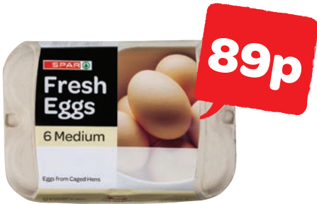
SPAR Medium Eggs - 6 Pack