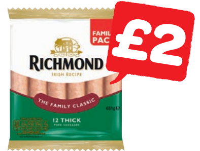
Richmond Irish Thick Sausages - 681g