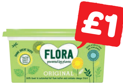
Flora Original - 500g