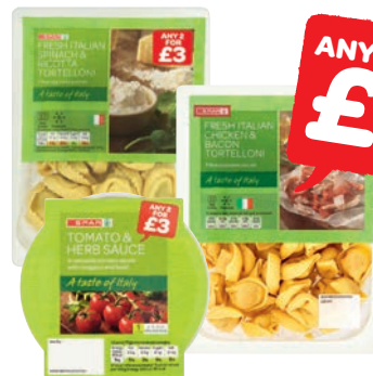
SPAR Tortelloni Spinach & Ricotta/Chicken & Bacon - 250g/ SPAR Sauce Tomato & Herb - 350g