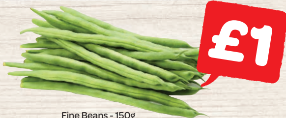
Fine Beans - 150g