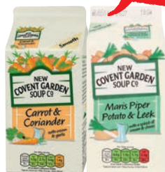
New Covent Garden Soup Carrot & Coriander/ Leek and Potato - 600g