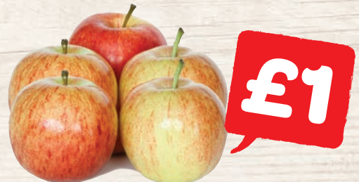
SPAR Value Apples - 5 Pack