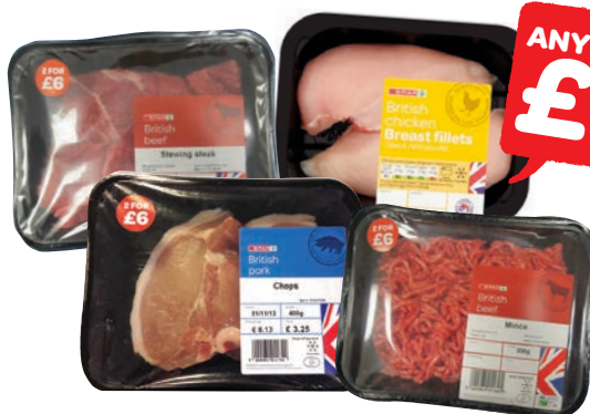
SPAR Stewing Steak 300g/SPAR Fresh Chicken Breast 285g/SPAR Pork Chops 400g/ SPAR Lean Mince 300g