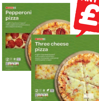
SPAR Pepperoni/Three Cheese Pizza - 365g/375g