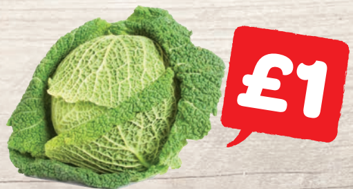
SPAR Savoy Cabbage - Single