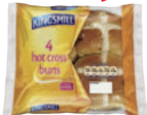
Kingsmill Hot Cross Buns 4 Pack