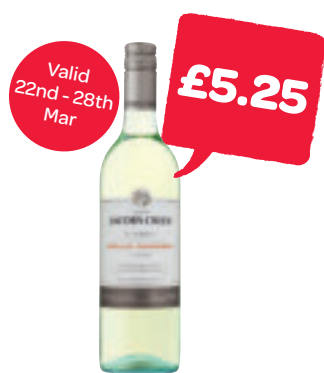
Jacobs Creek Semillon Chardonnay - 75cl