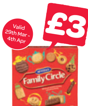
Family Circle Biscuits 670g