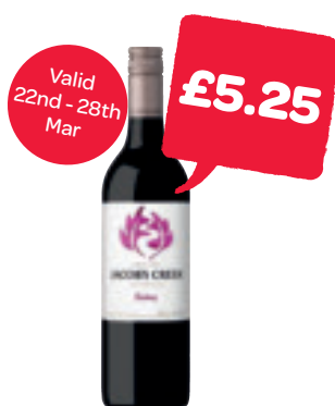
Jacobs Creek Shiraz - 75cl