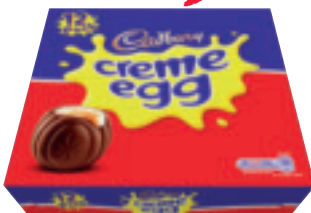
Cadbury Crème Egg 12 Pack