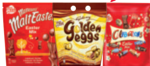
Galaxy Golden Eggs Mix/Malteser Mix/ Celebrations Easter Pouch 270g - 450g