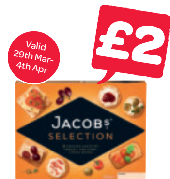
Jacobs Biscuits for Cheese 300g