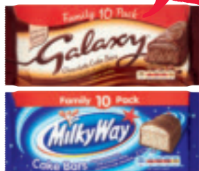
Cake Bars Galaxy/Mars Milky Way - 10 Pack