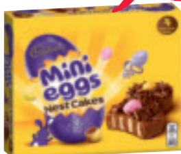
Cadbury Mini Egg Nests 4 Pack