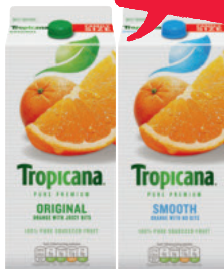
Tropicana Original/Smooth 1.6 Litre

Grocery 08/03/18 - 04/04/18 Fresh & Frozen 22/03/18 - 18/04/18 Alcohol: 15/03/18 - 11/04/18