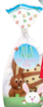
SPAR Bagged Bunny 150g